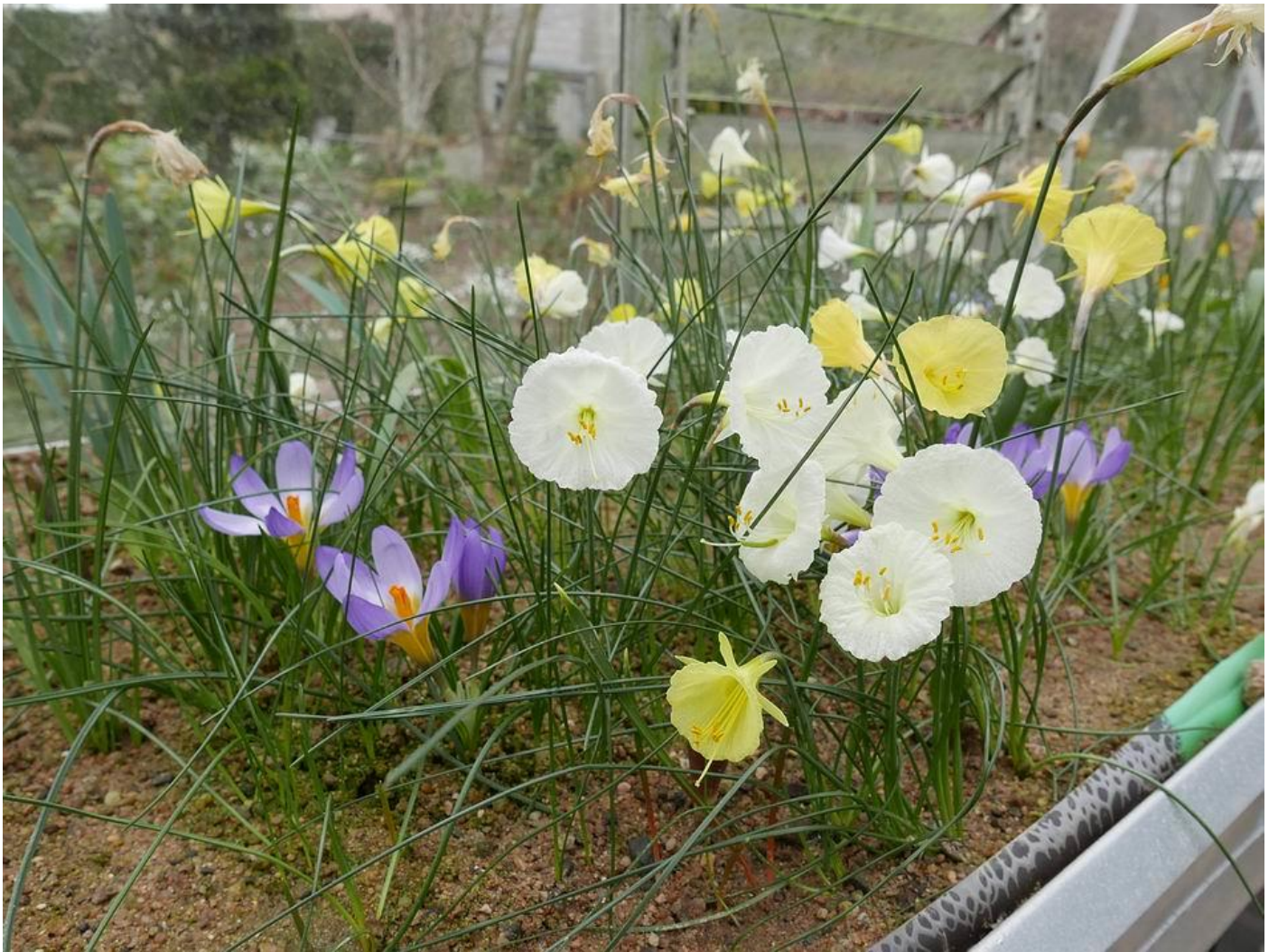
The next few pictures are of the lovely random flowering combinations in the mixed plantings of bulbs.