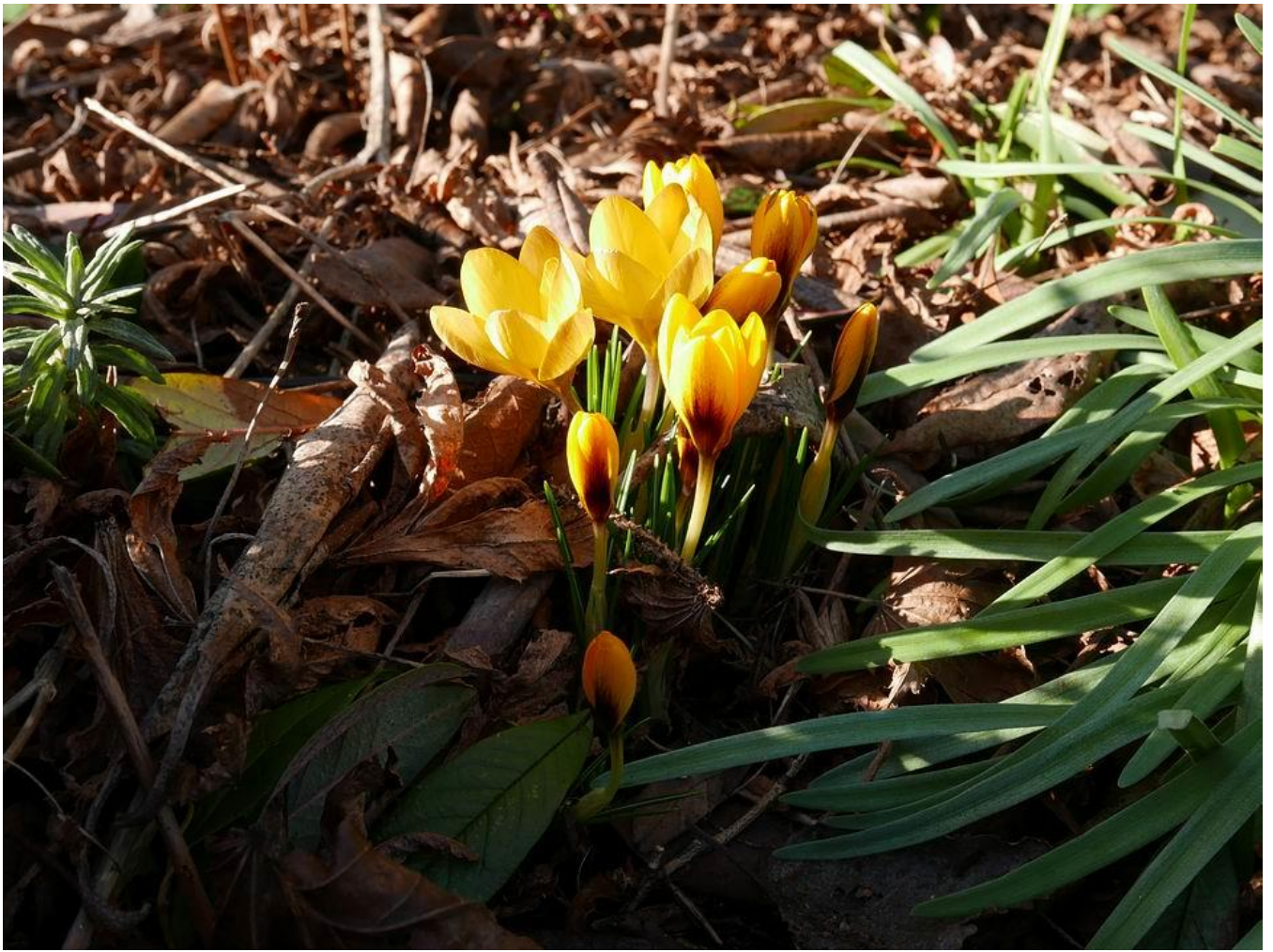
Crocus chrysanthus cultivars