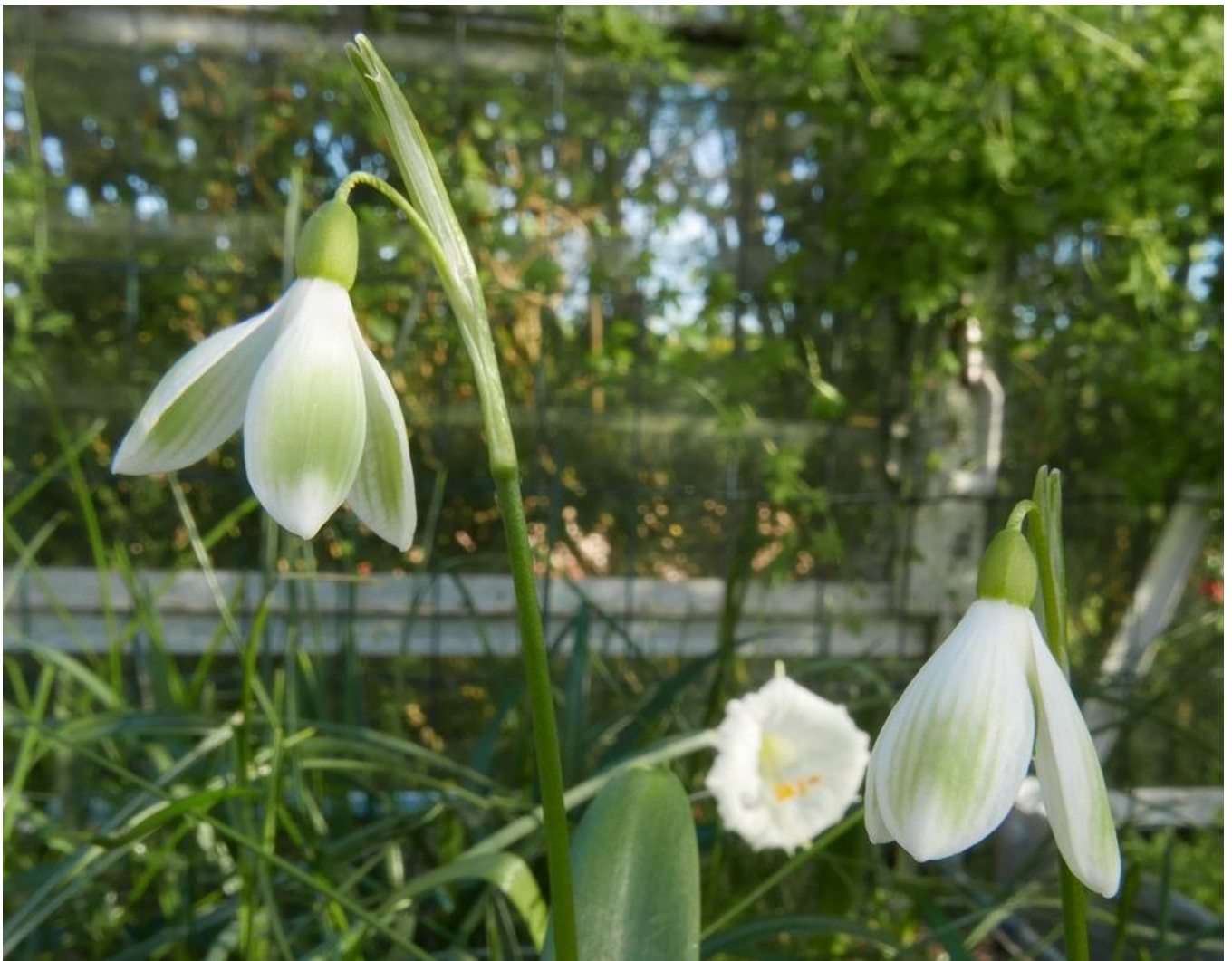
Two different clones of Galanthus woronowii with green markings on the outer petals.