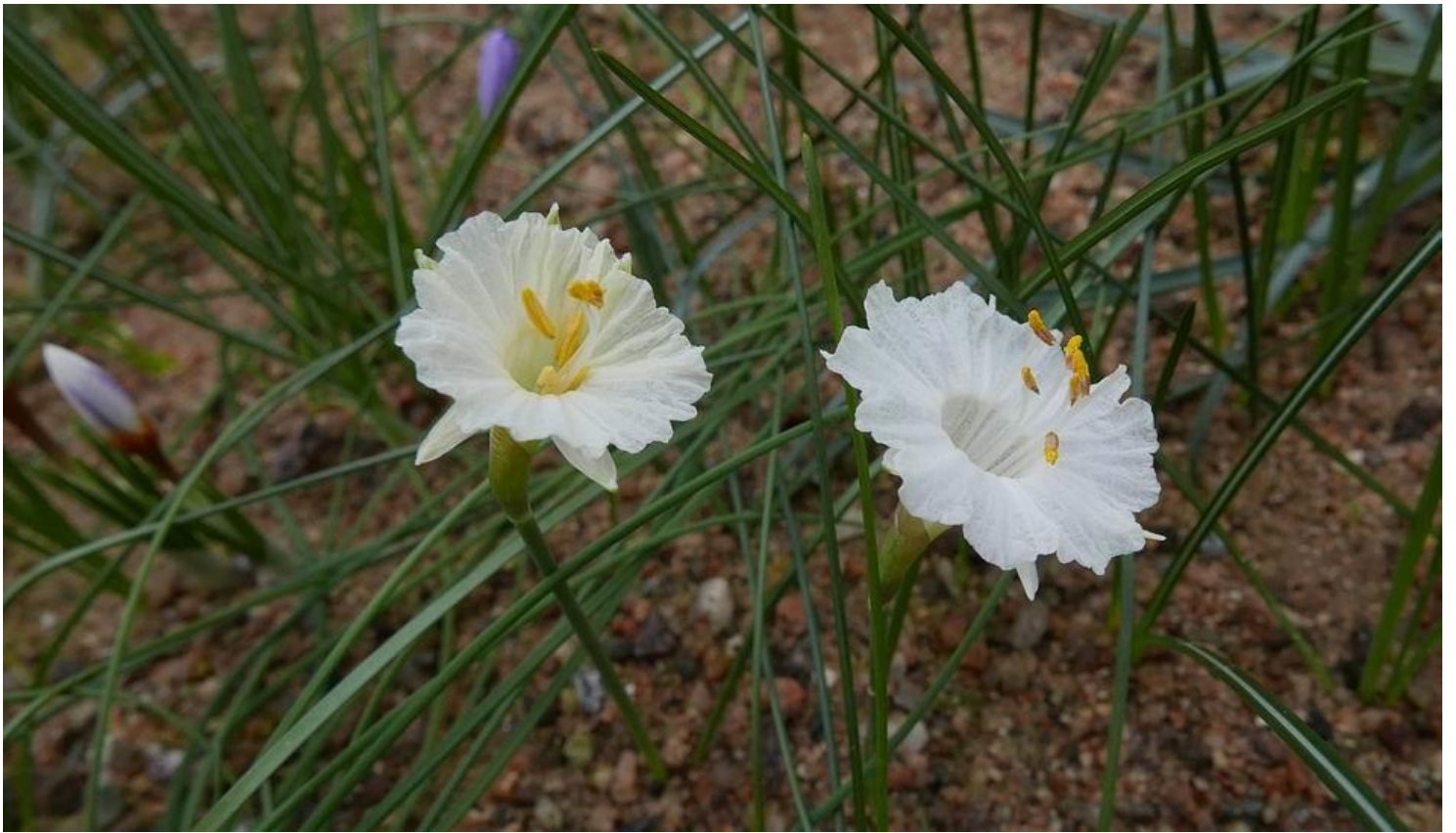
Narcissus cantabricus petunioides