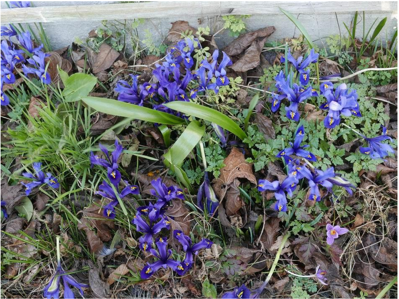
These Iris reticulata are flowering through the debris of autumn and last year's growth.