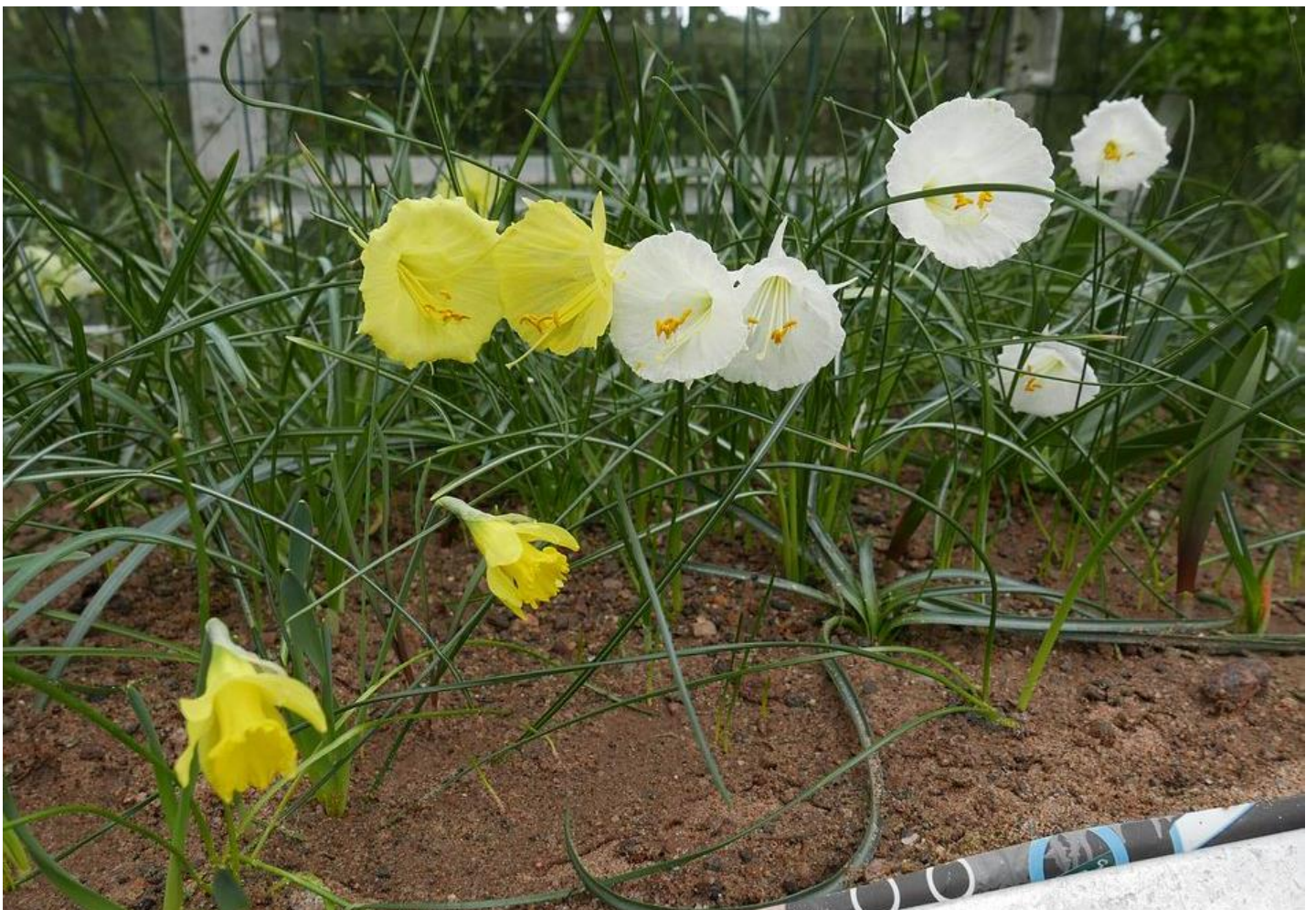
Narcissus asturiensis vasconicus, Narcissus bulbocodium and hybrids.

I do give Narcissus asturiensis vasconicus a special place to grow in the bulb house sand bed because it is very small and not really suited to growing in the garden beds where it could easily get overlooked.