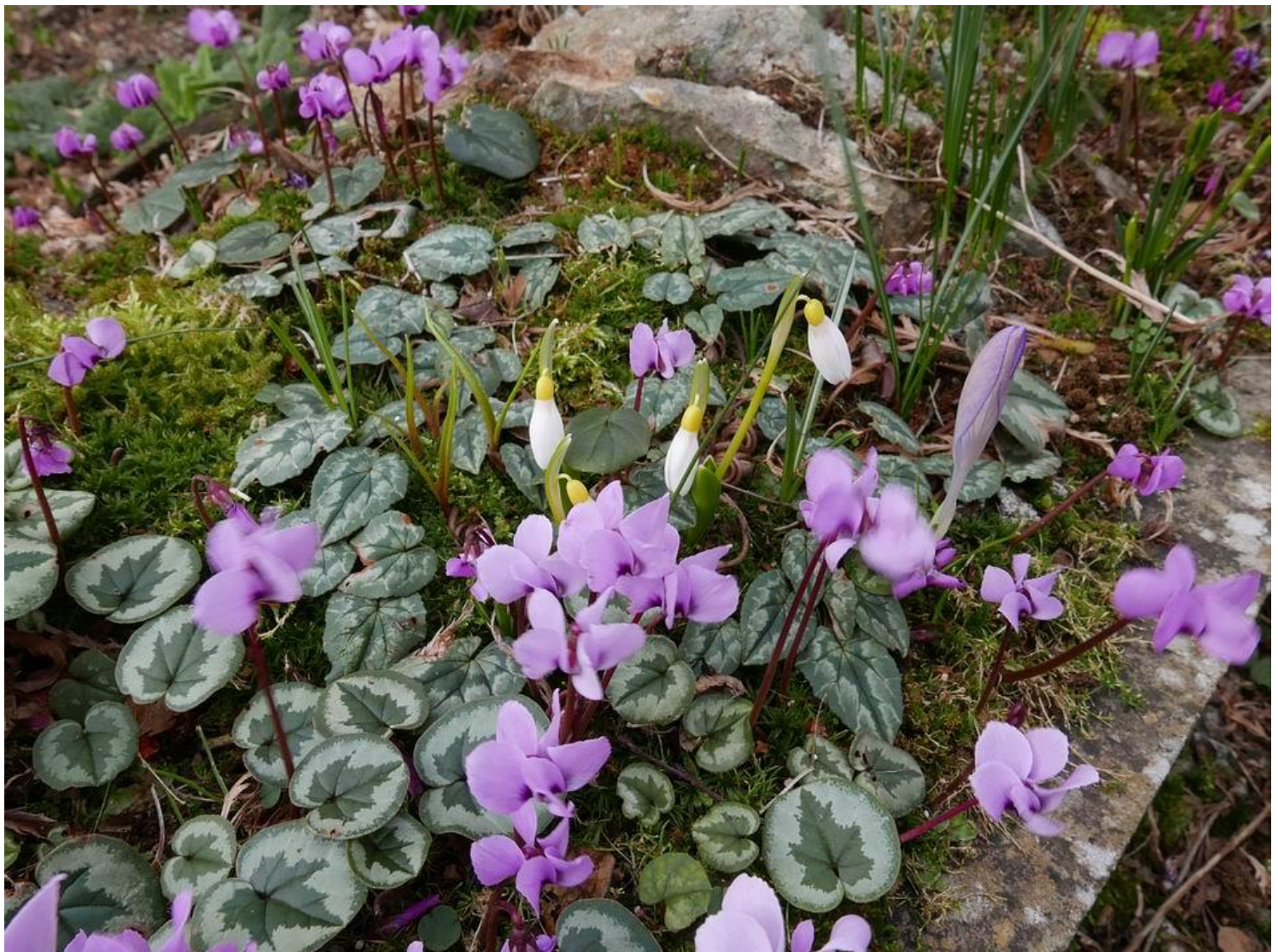
Galanthus 'Elizabeth Harrison' growing with Cyclamen coum .

Galanthus 'Elizabeth Harrison' was discovered in the Scottish garden of the lady whose name it bears and it has attractive and distinctive yellow ovaries and markings.