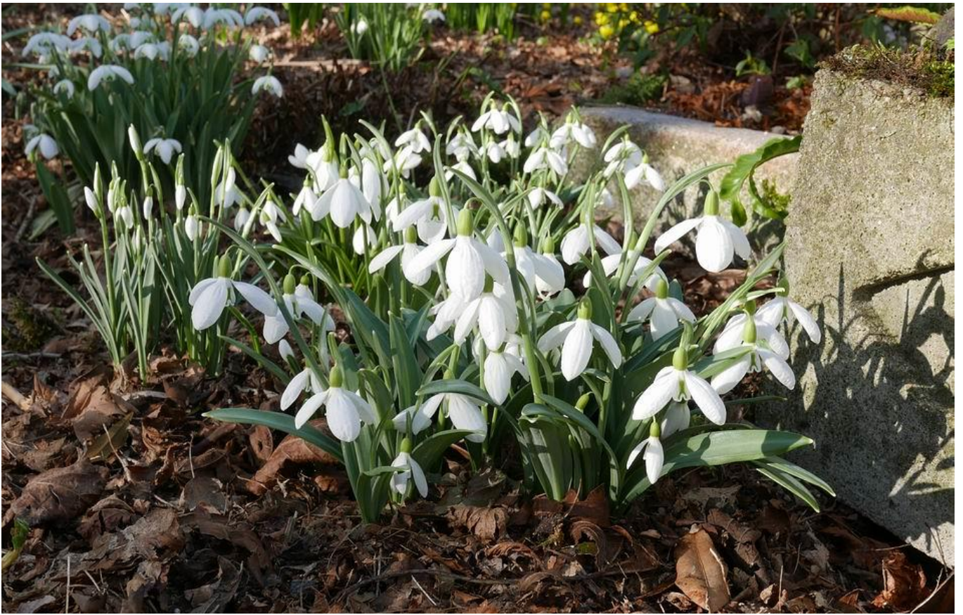
The snowdrops are really enjoying this period of mild sunny weather we are having opening their flowers and shedding their pollen.