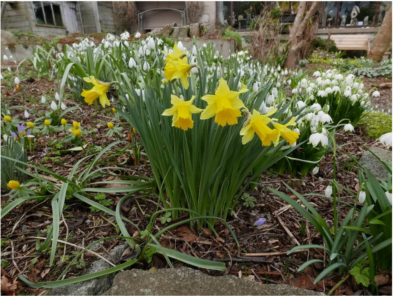
The early trumpet daffodils are also making a welcome appearance with Narcissus hispanicus always being among the first into flower.