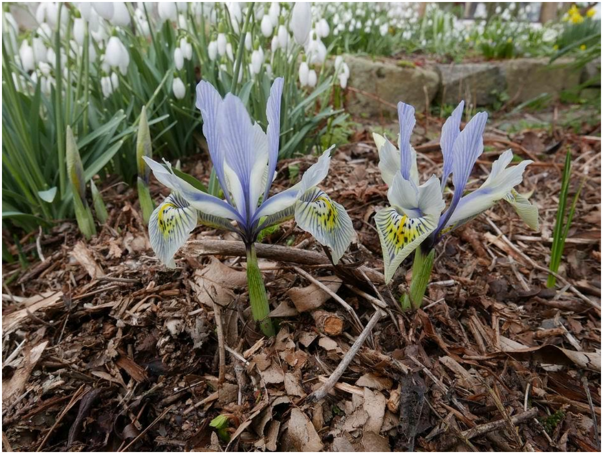
Iris 'Katharine Hodgkin' flowers are also opening in these fine weather conditions.