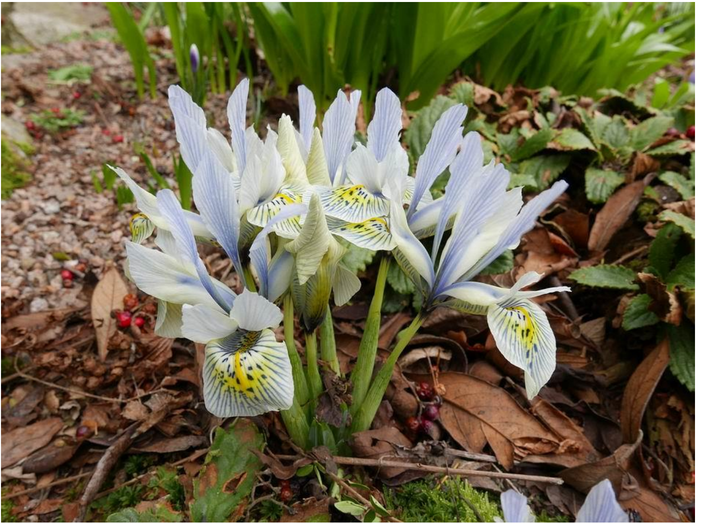
Iris 'Katharine Hodgkin'