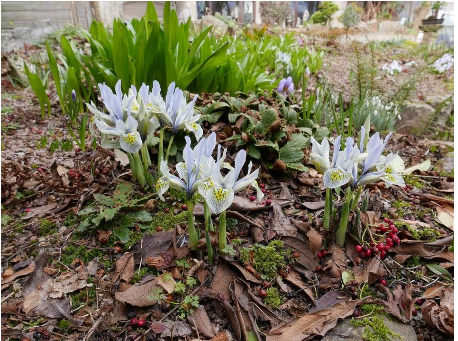
Iris 'Katharine Hodgkin'